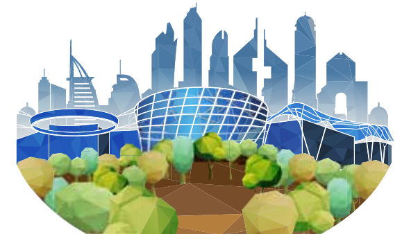
CENTRAL PARK at City Walk