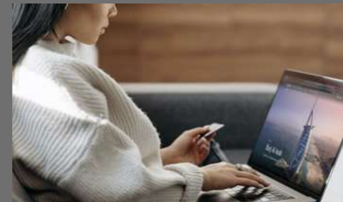
Pay with Points