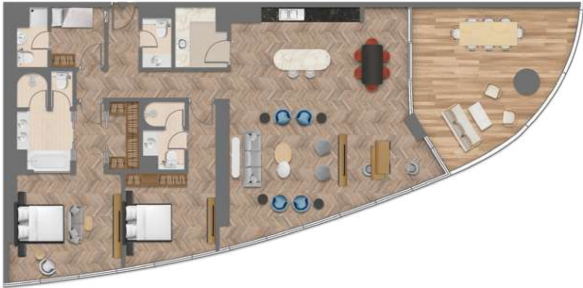
2 BEDROOM APARTMENT, TYPE B