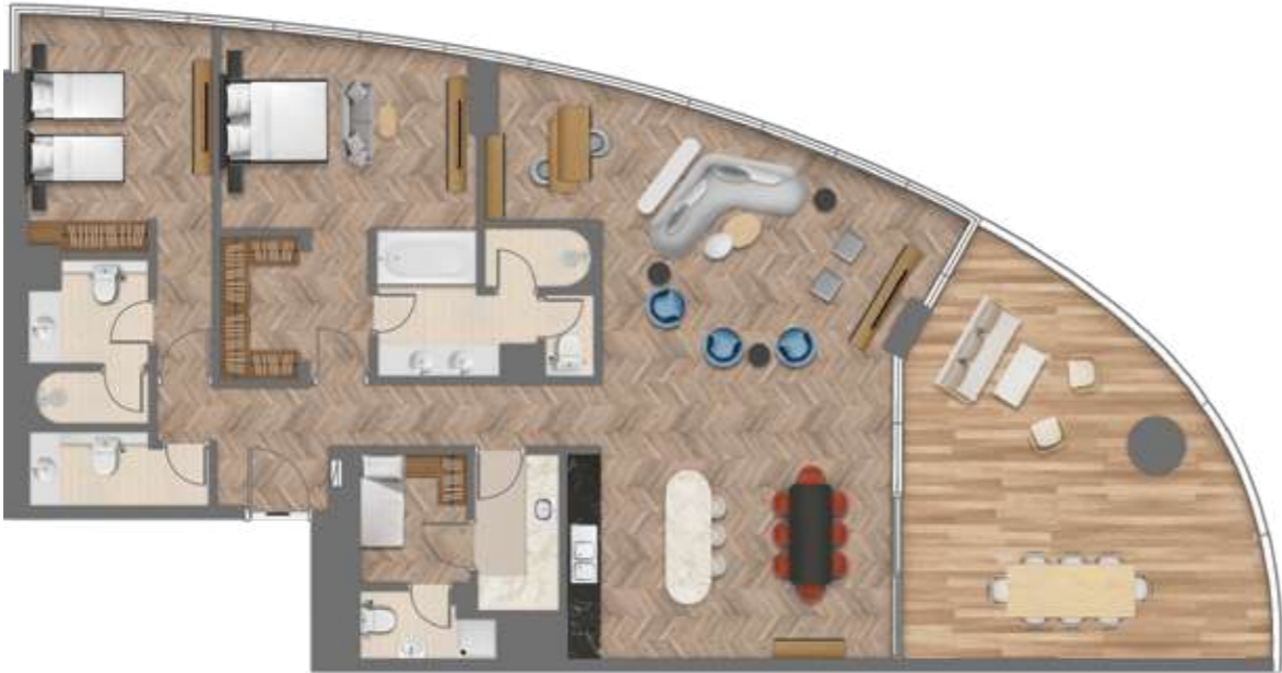
2 BEDROOM APARTMENT, TYPE A