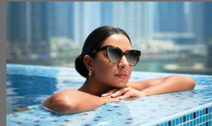
Lifestyle & Experiences