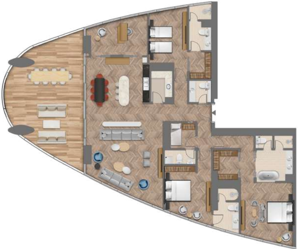
3 BEDROOM APARTMENT, TYPE A