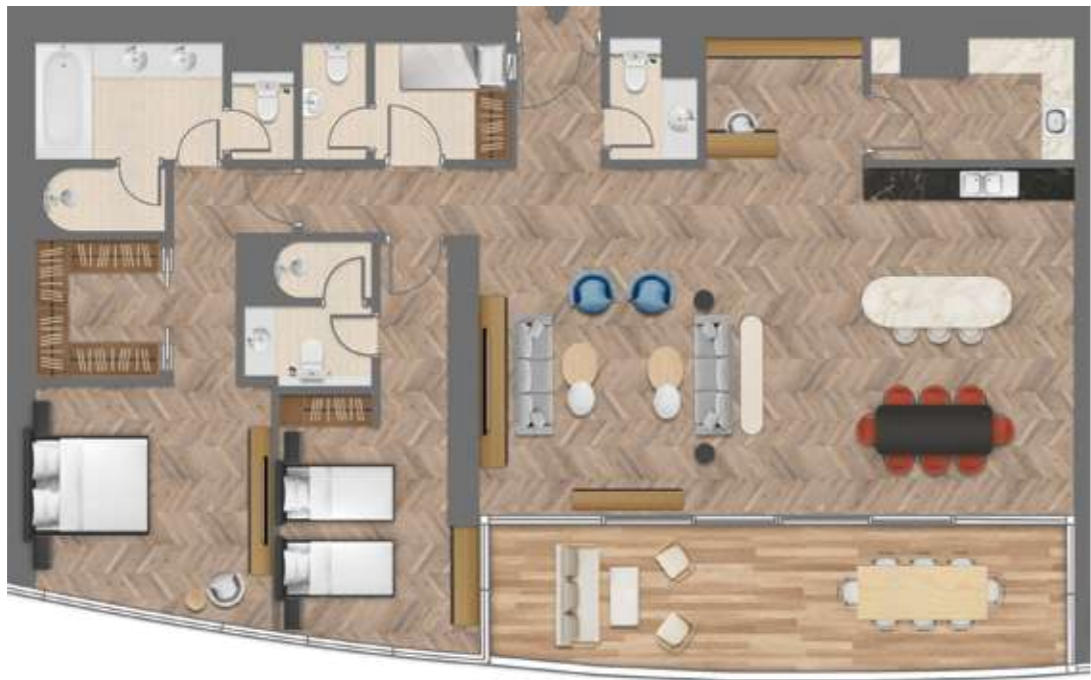
2 BEDROOM APARTMENT, TYPE C