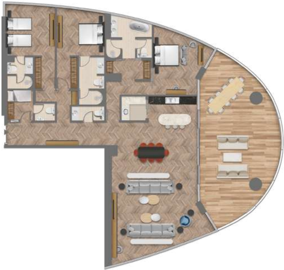
3 BEDROOM APARTMENT, TYPE B