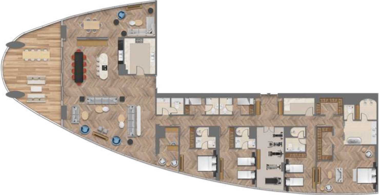
4 BEDROOM APARTMENT, SIMPLEX