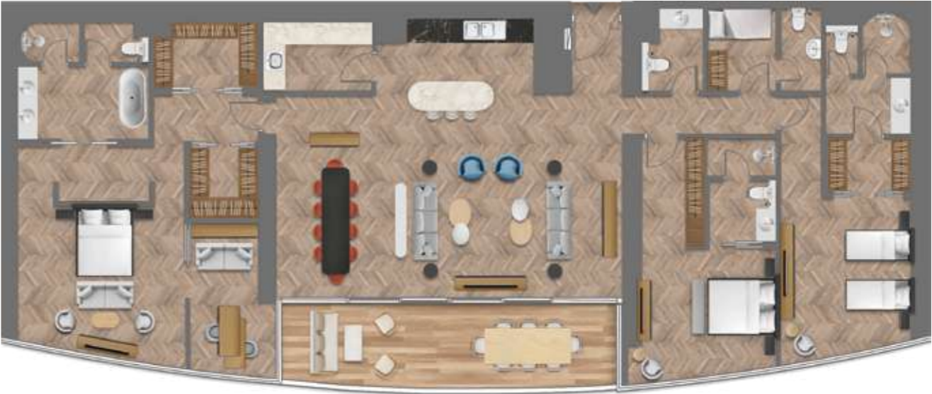
3 BEDROOM APARTMENT, TYPE C