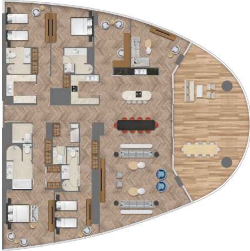
4 BEDROOM APARTMENT, TYPE A