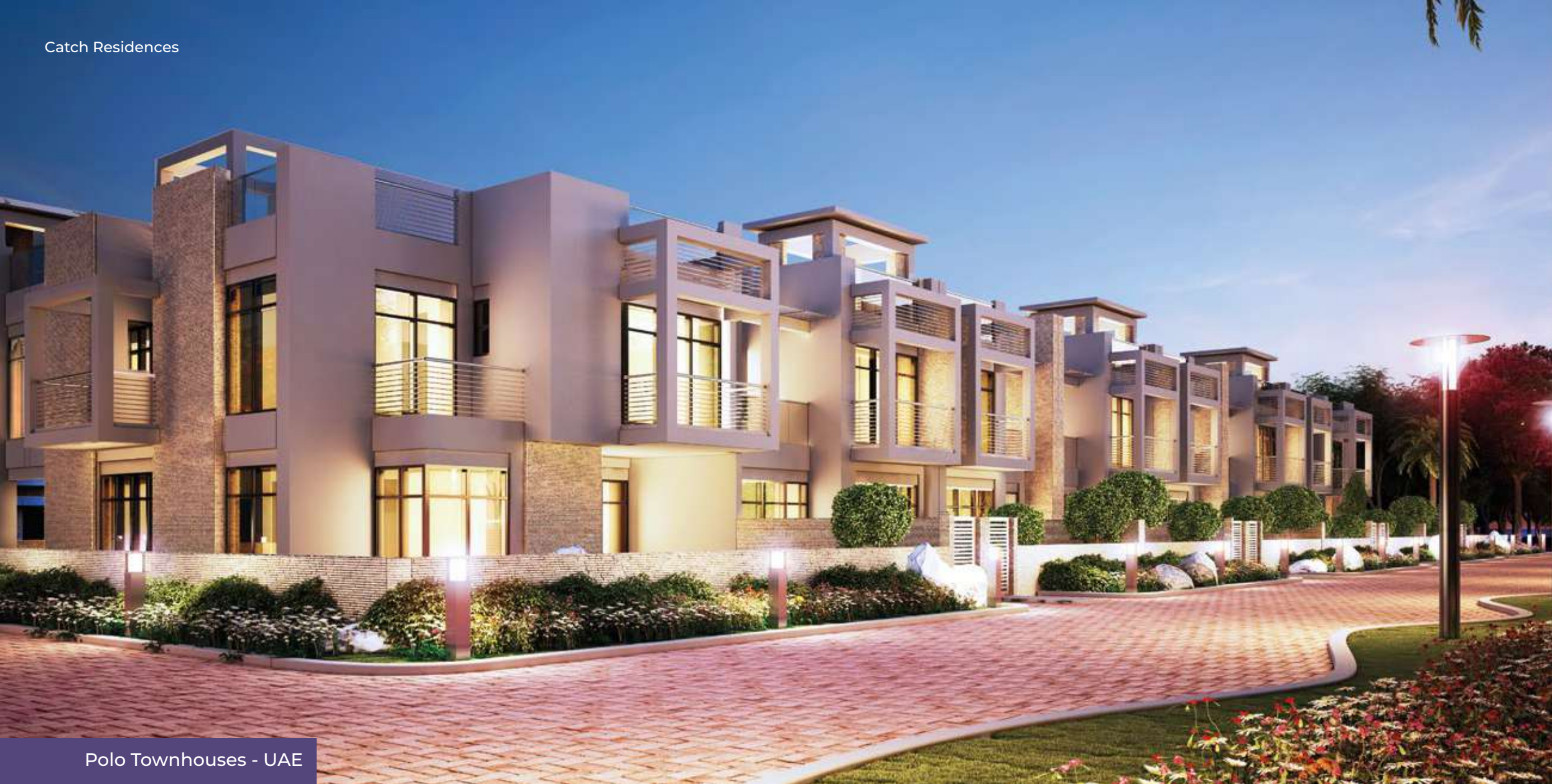
Polo Townhouses - UAE