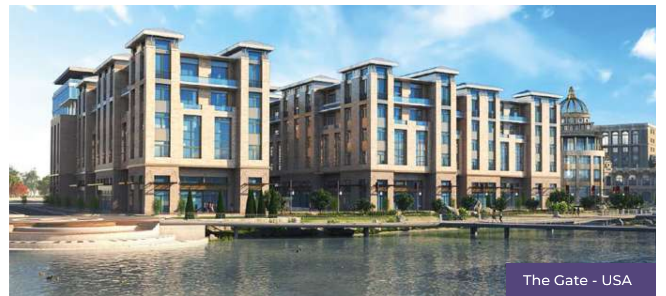
The Gate - USA

Today, an expanded and impressive portfolio of premium properties, which includes some of the most sought-after properties by meticulous clients worldwide, serve as a testament to IGO's well-deserved reputation as one of the top regional investment companies.