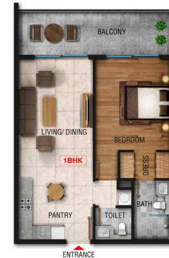
TYPE 2 EXECUTIVE