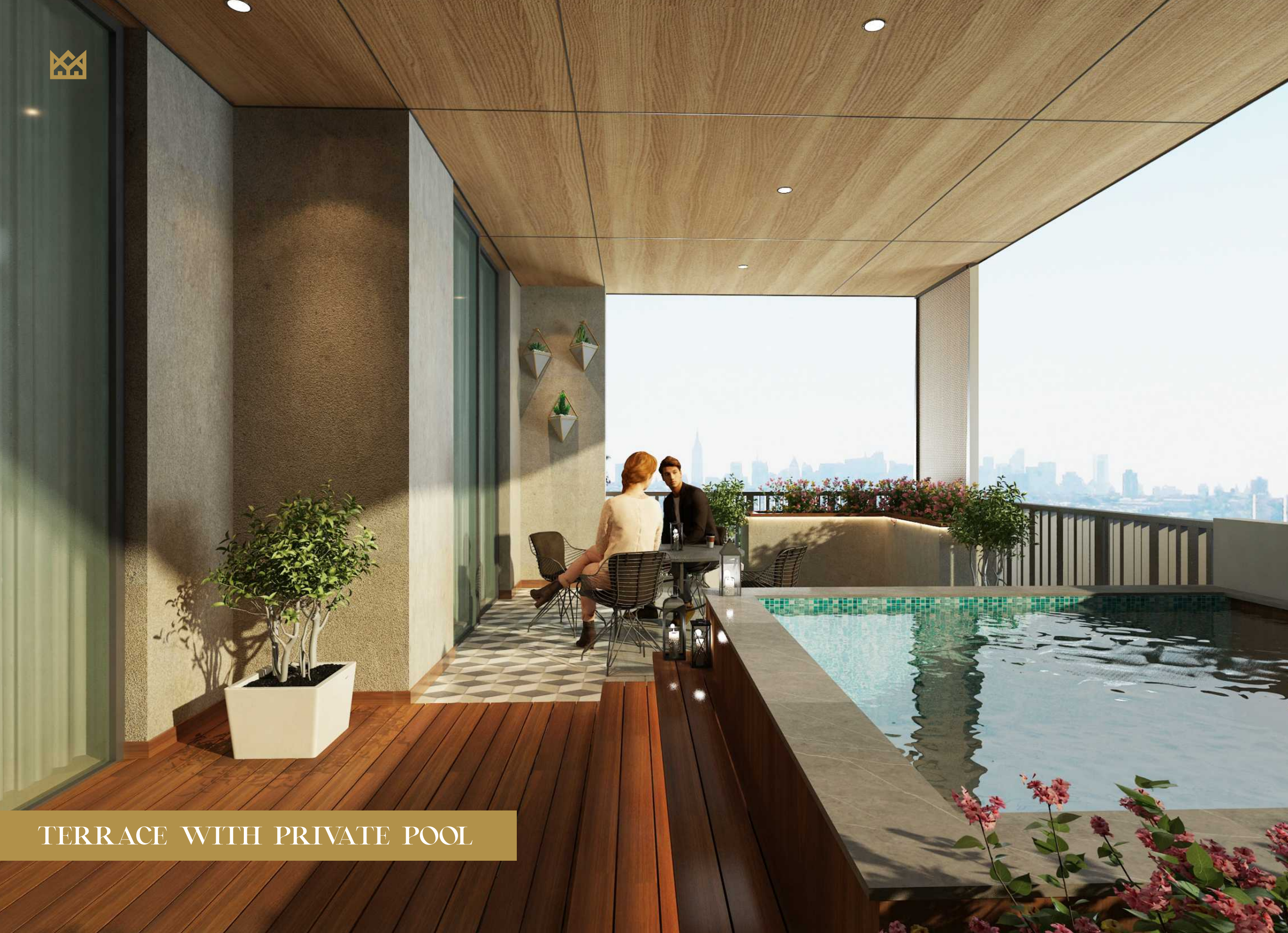
TERRACE WITH PRIVATE POOL