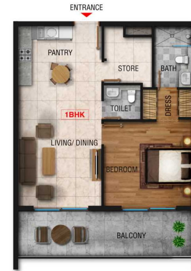
TYPE 1 PREMIUM

Disclaimer: all pictures, plans, layouts, information, data and details included in this brochure are indicative only and may change at any time up to the final 'as built' status in accordance with the final designs of the project, regulatory approvals and planning permissions.