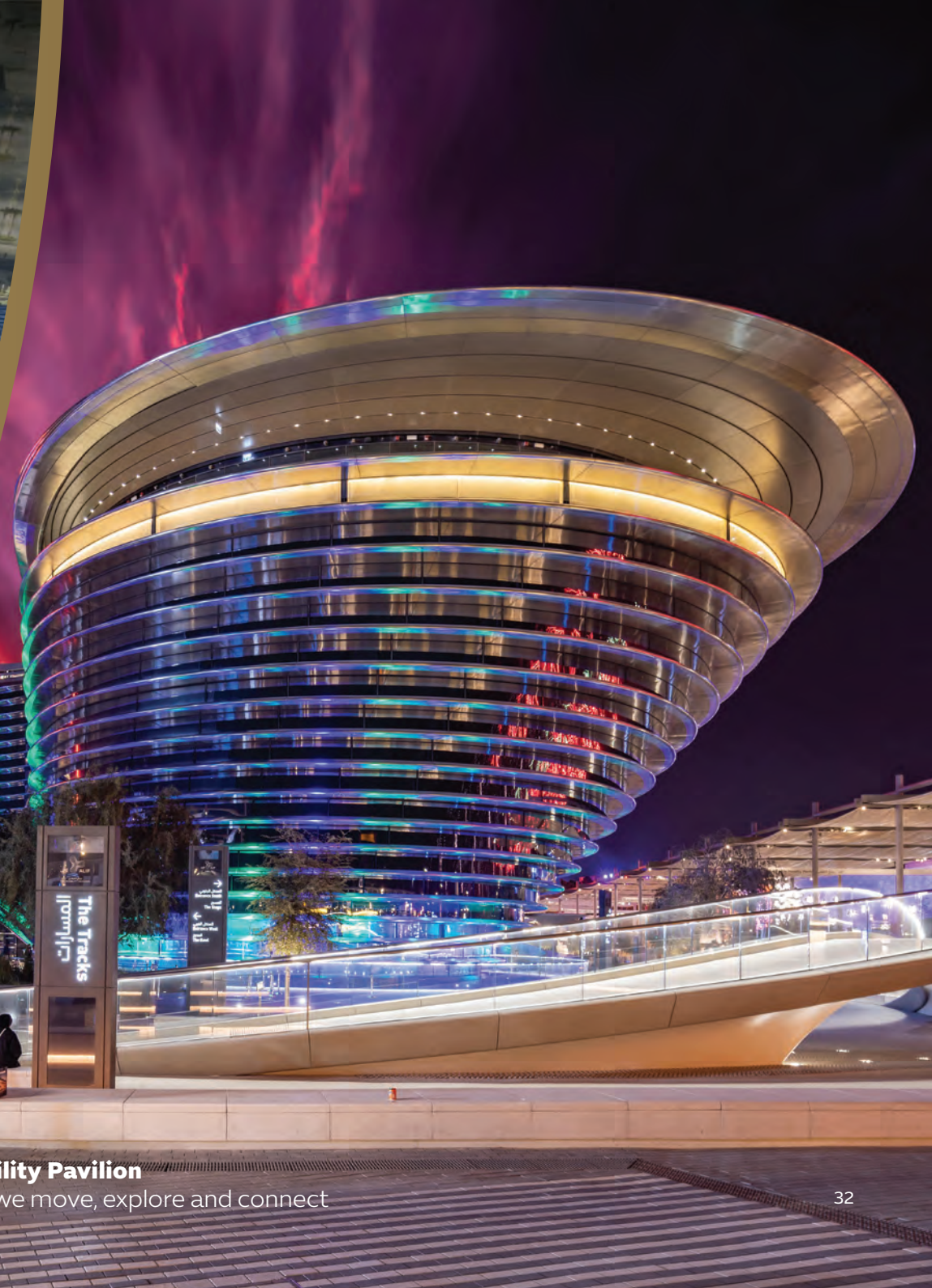
Alif – The Mobility Pavilion Exploring how we move, explore and connect