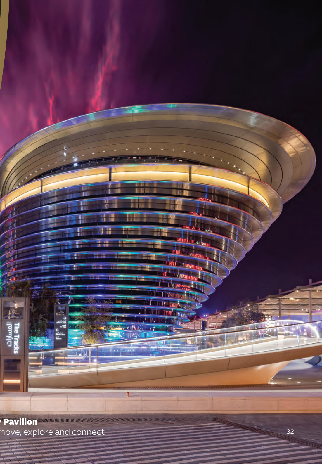
Alif – The Mobility Pavilion Exploring how we move, explore and connect