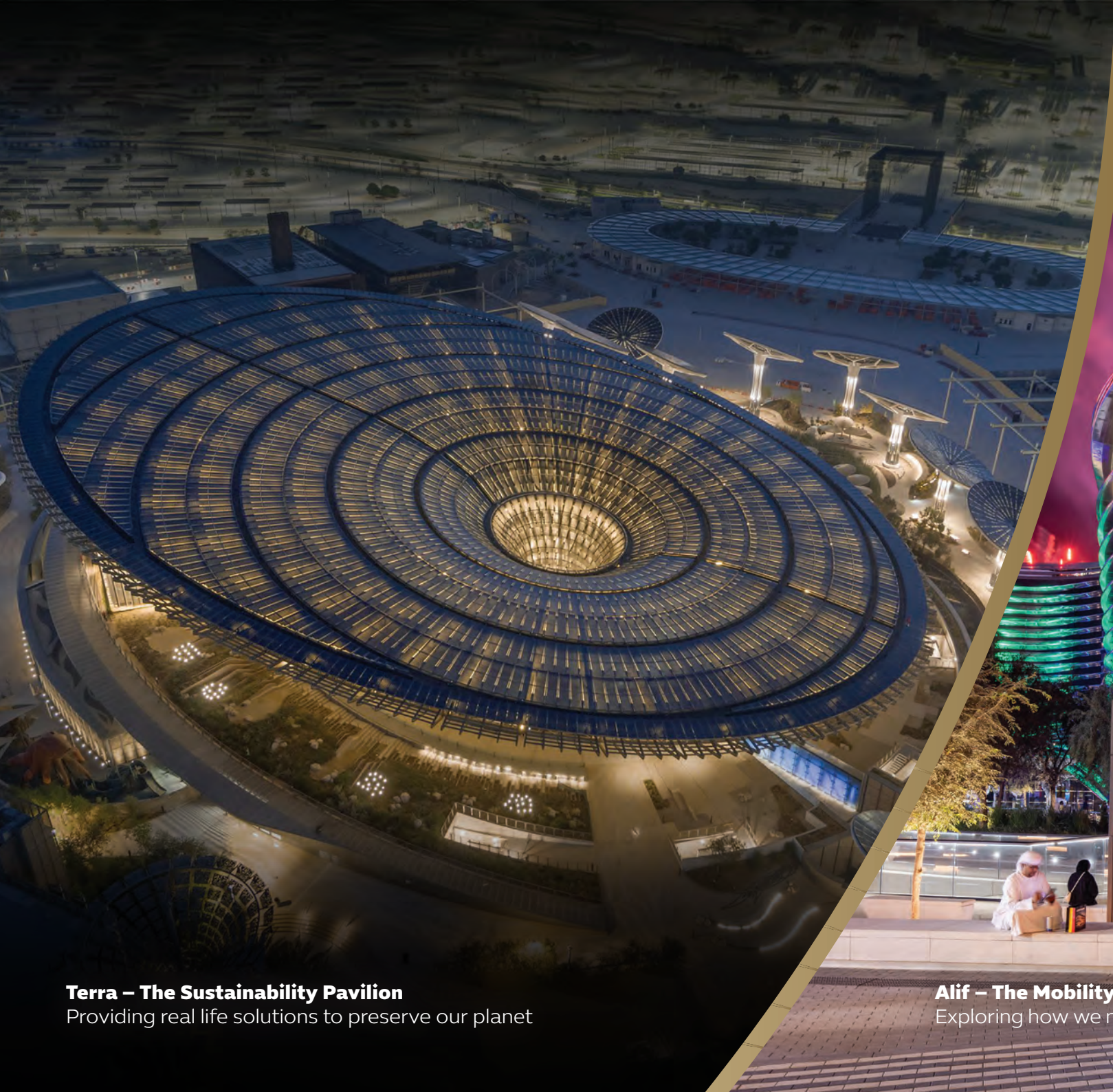
Terra – The Sustainability Pavilion Providing real life solutions to preserve our planet