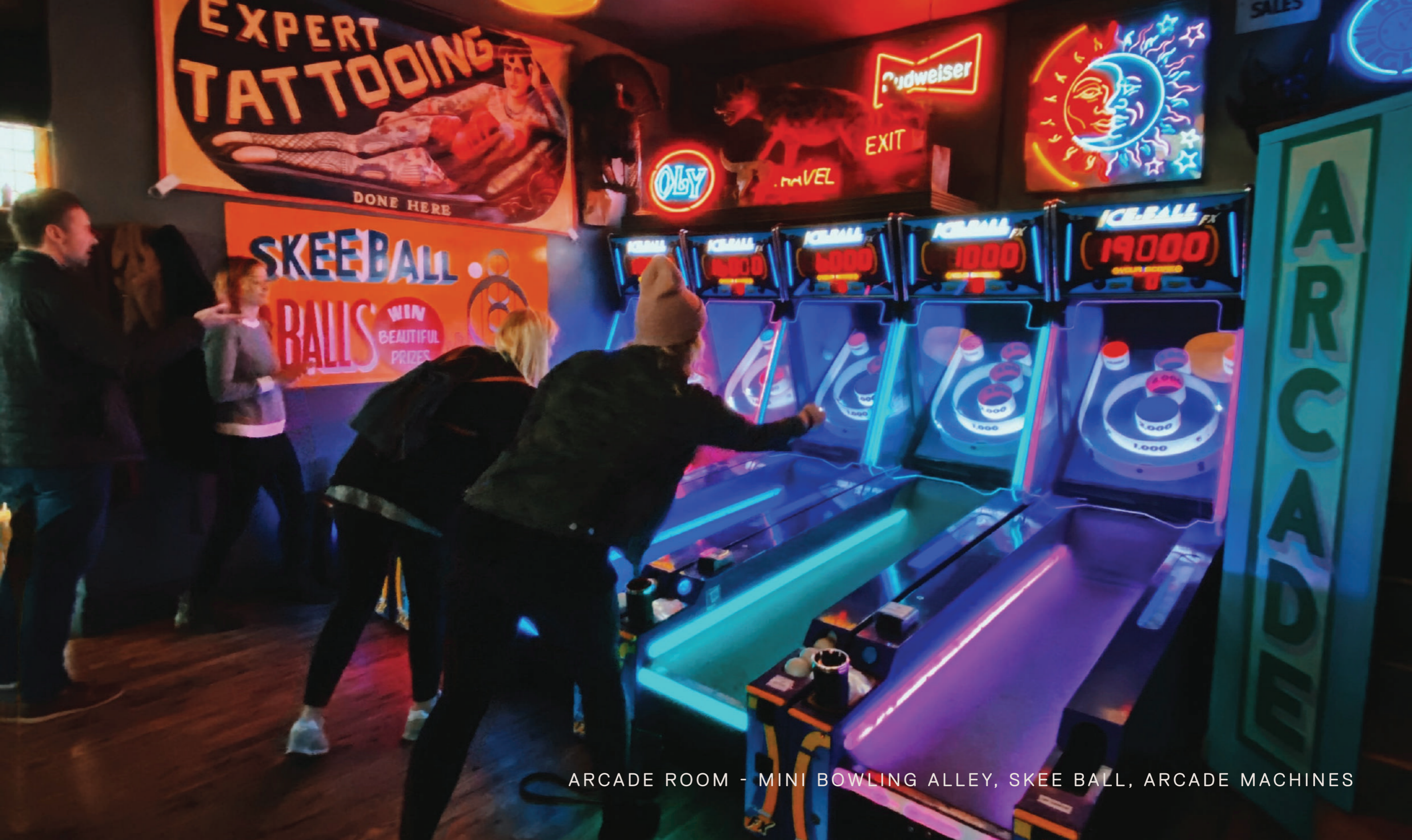
ARCADE ROOM - MINI BOWLING ALLEY, SKEE BALL, ARCADE MACHINES