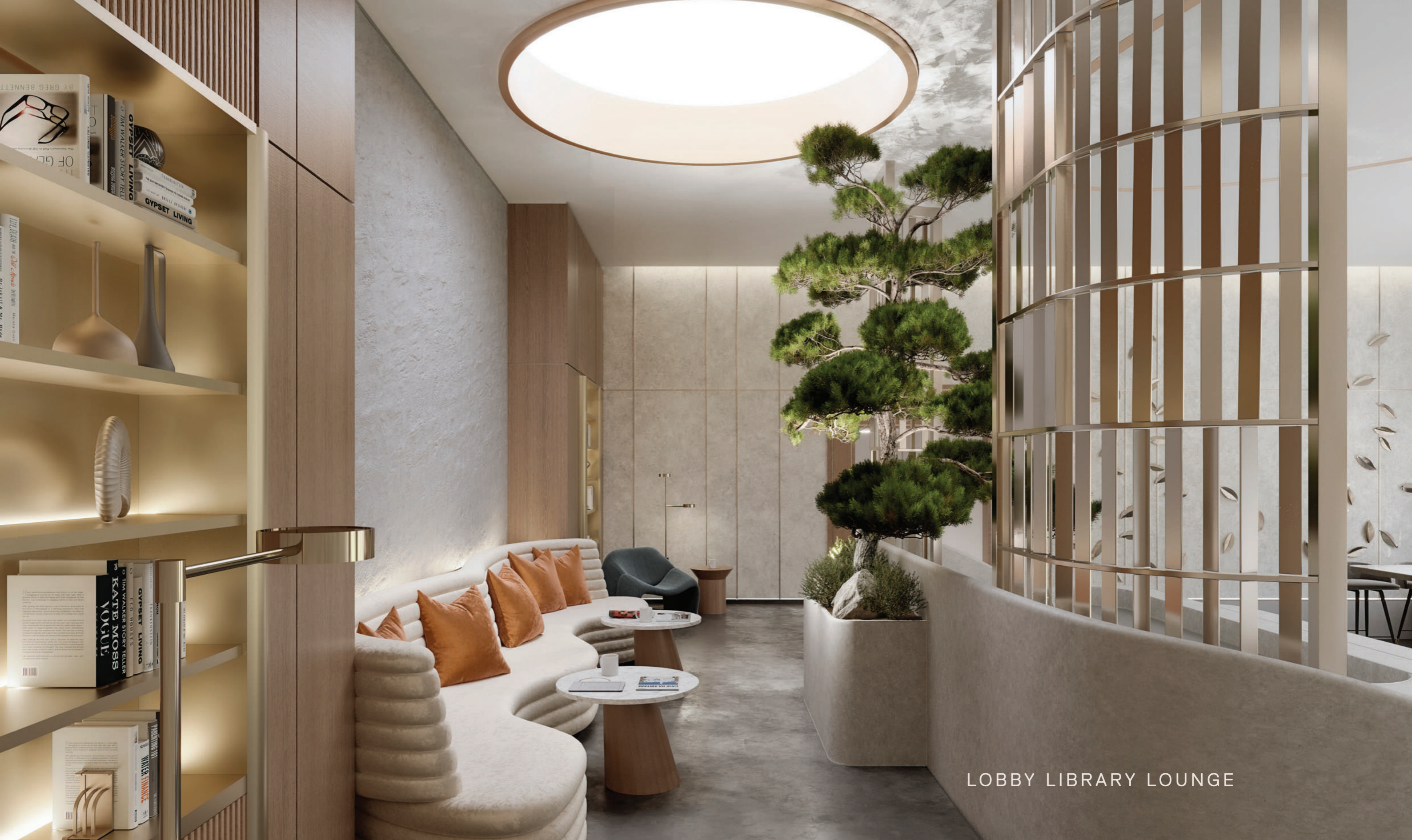
LOBBY LIBRARY LOUNGE