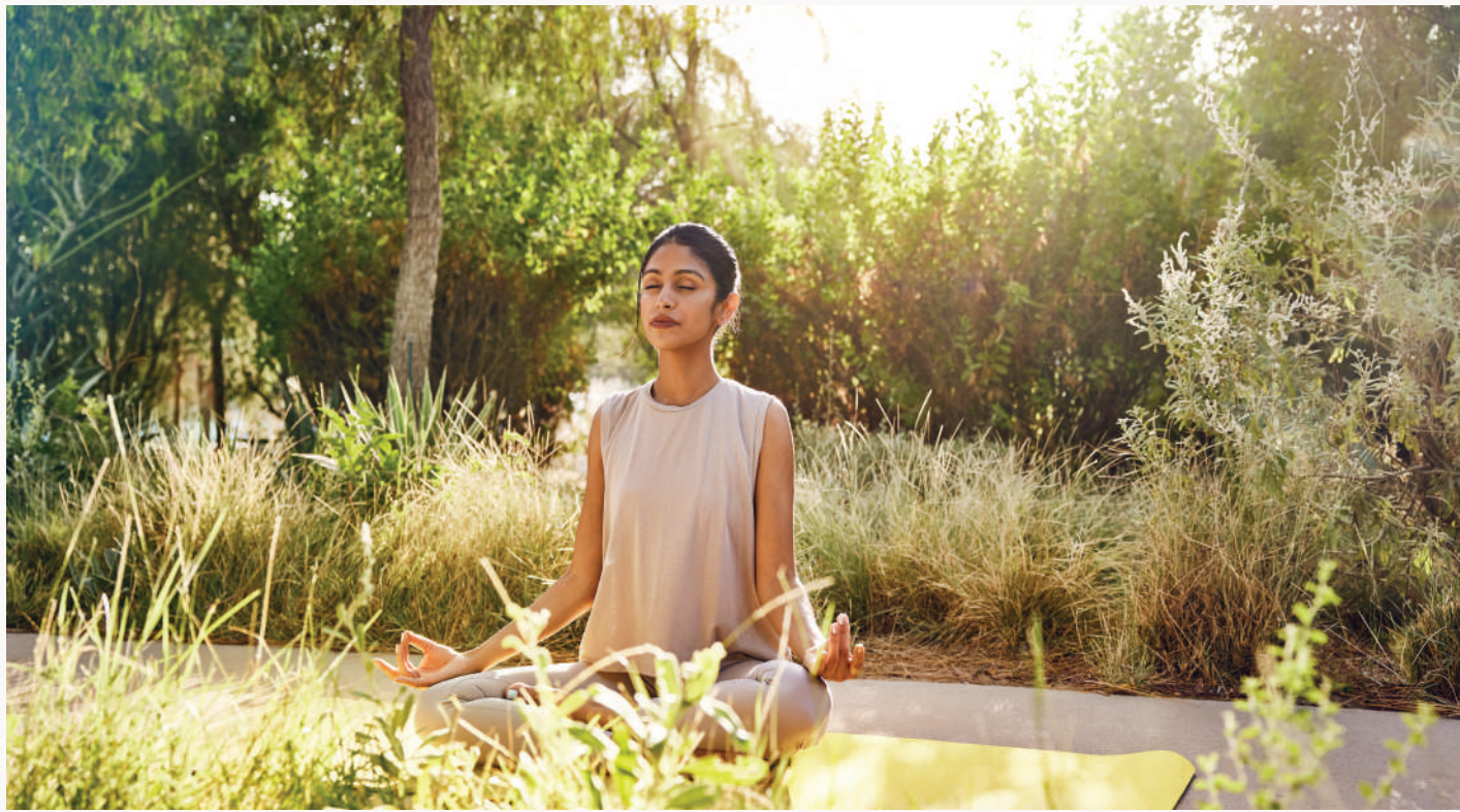
Yoga studio, health & beauty salon, spa and sauna