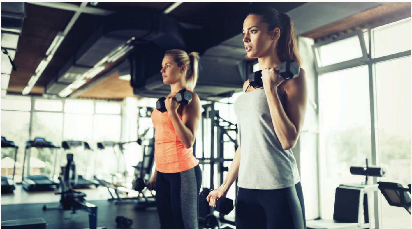
Gyms, outdoor wellness and fitness areas