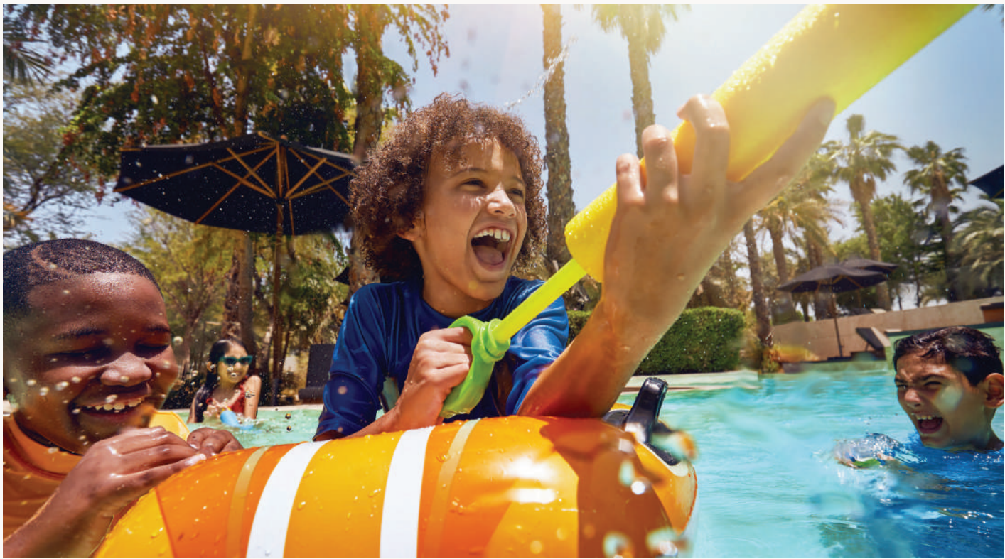
Swimming pools, splash pads and kids' play areas