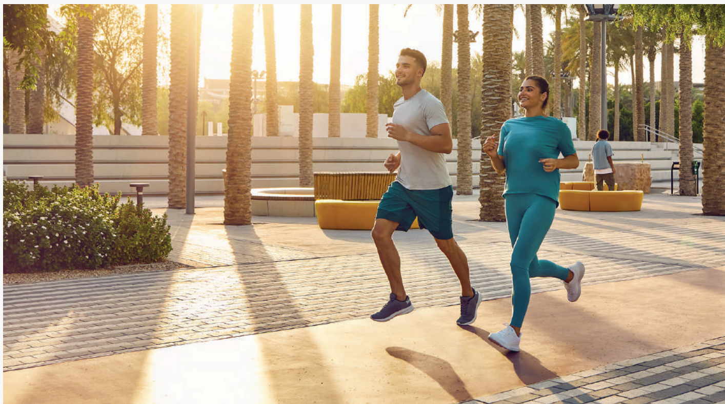
4.5 km of pedestrian tracks and 5.2 km of cycling trails