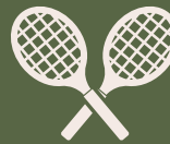
Squash & Tennis Court