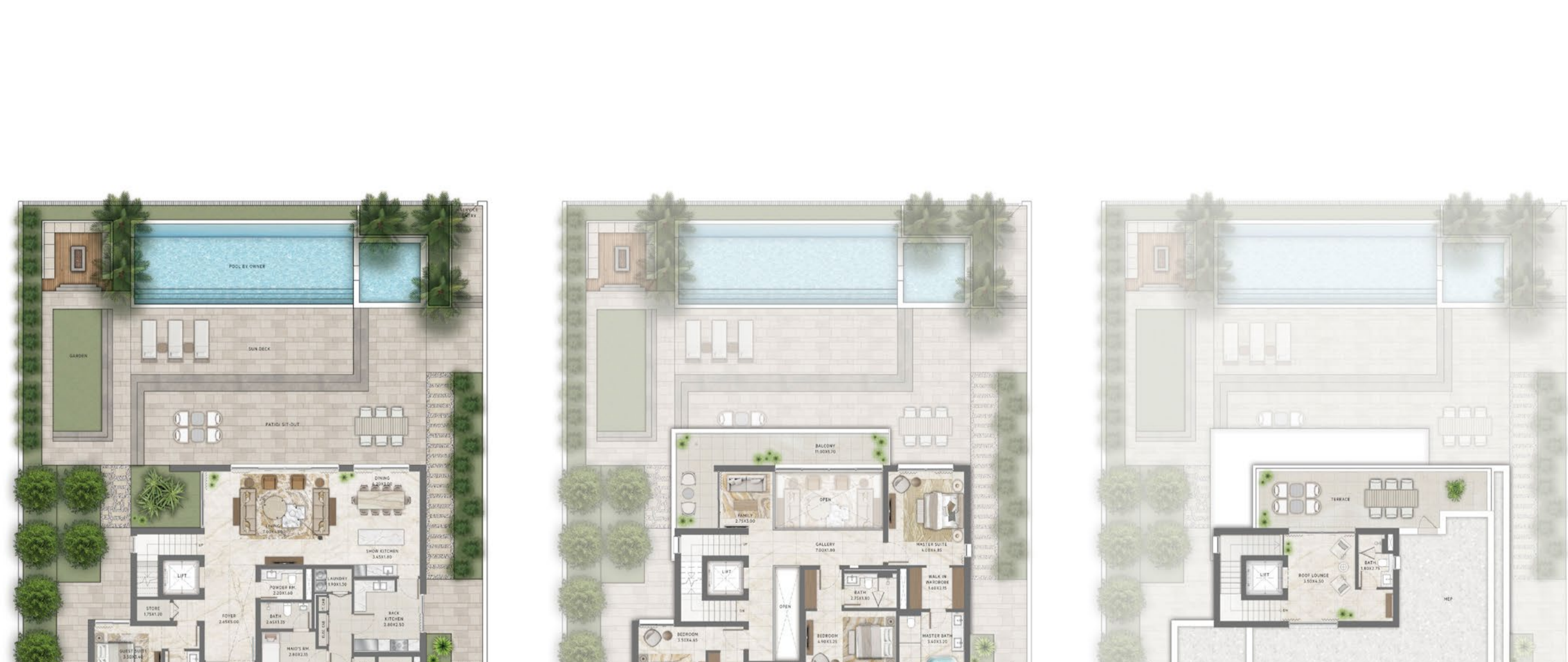
4-Bedroom Villa Contemporary