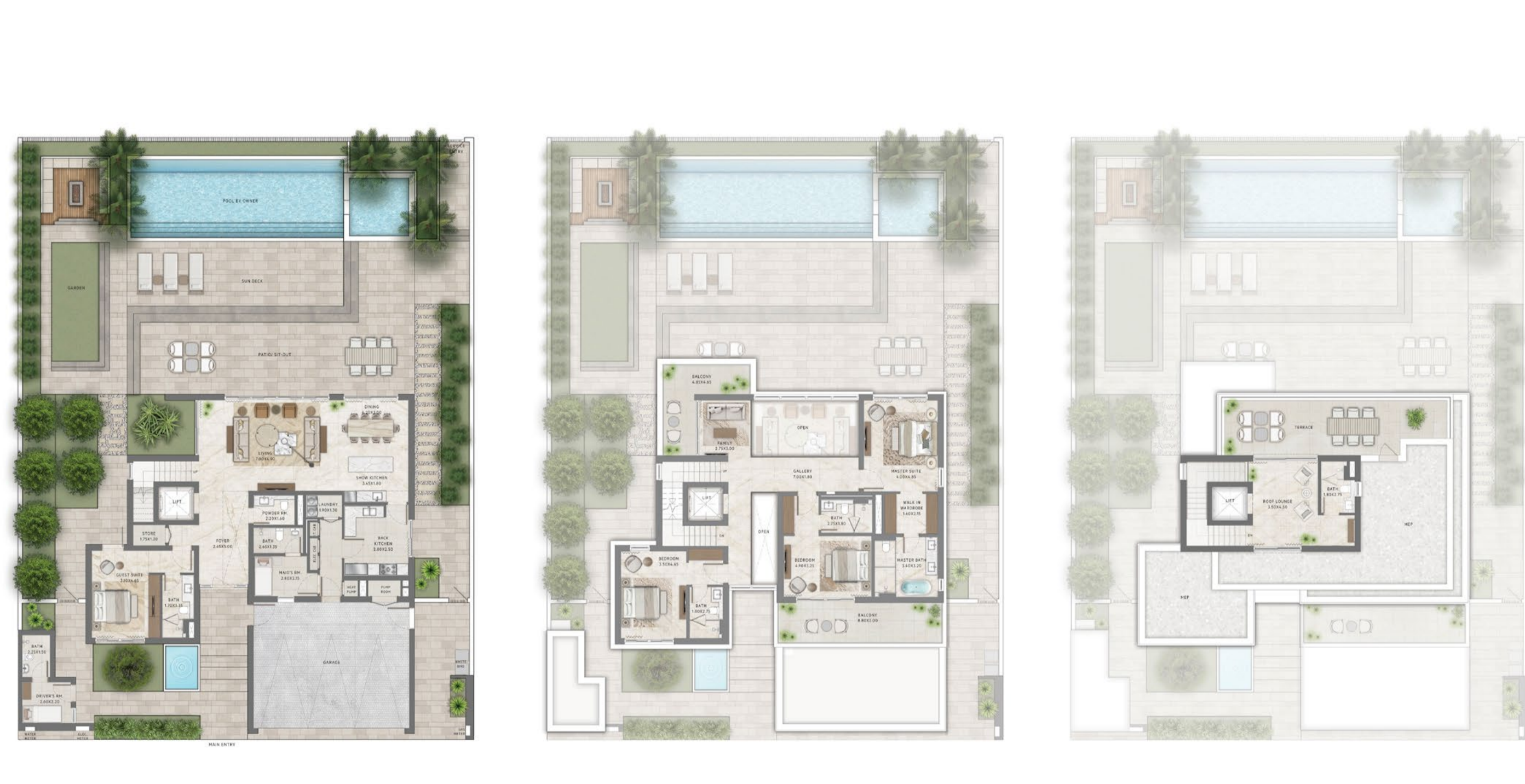
4-Bedroom Villa Classic